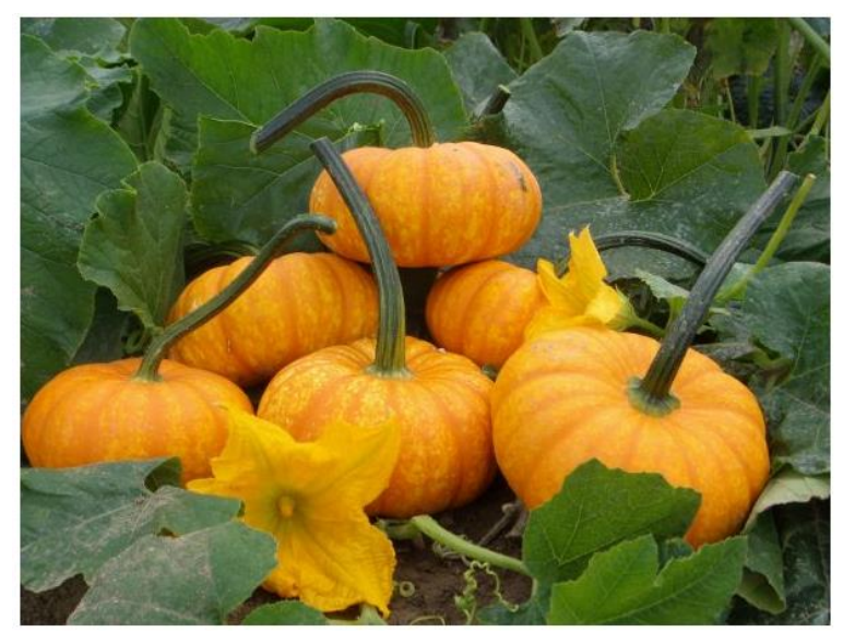
'Lil Orange Mon' had the highest yield in pounds, but not in count

Most marketable pounds per cultivar may not be useful for many growers Marketable count may be more useful